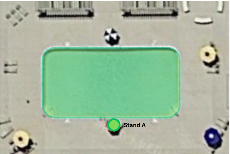
Minimum 1 Lifeguard - Total Coverage