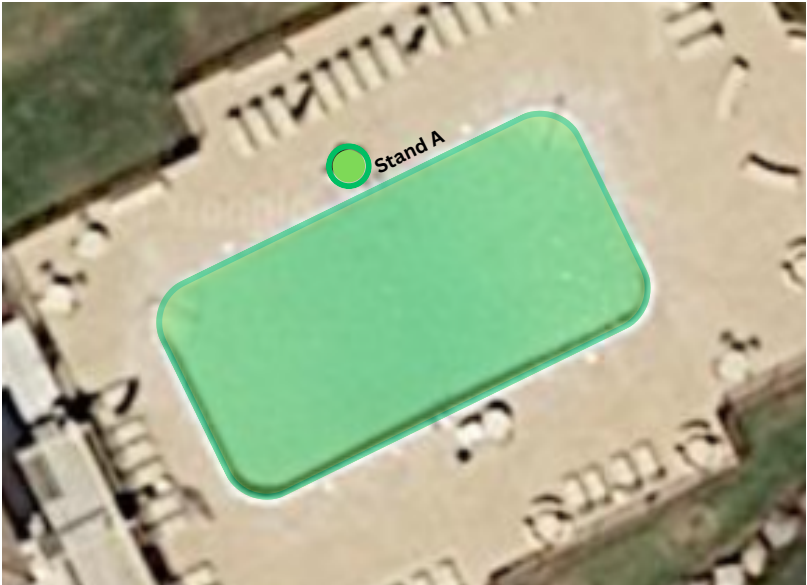
Minimum 1 Lifeguard - Total Coverage