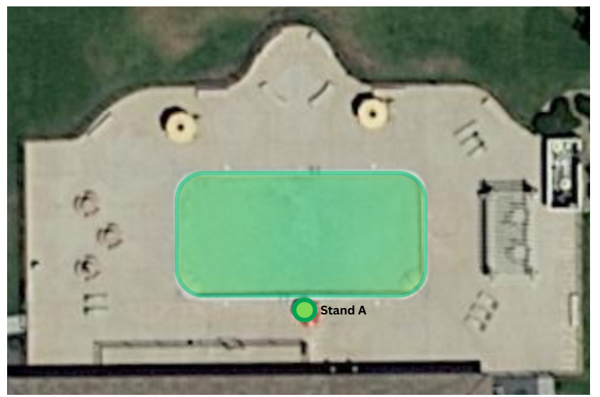
Minimum 1 Lifeguard - Total Coverage