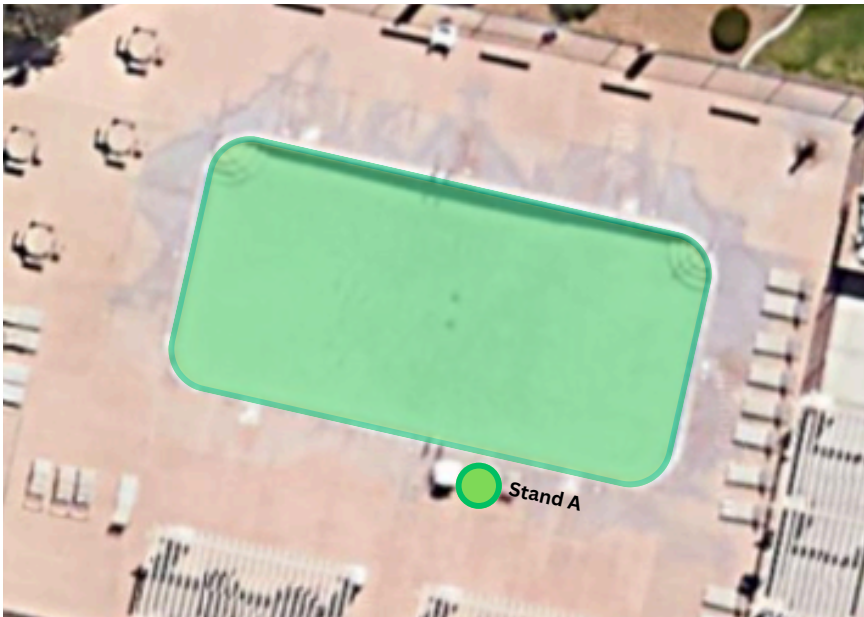
Minimum 1 Lifeguard - Total Coverage