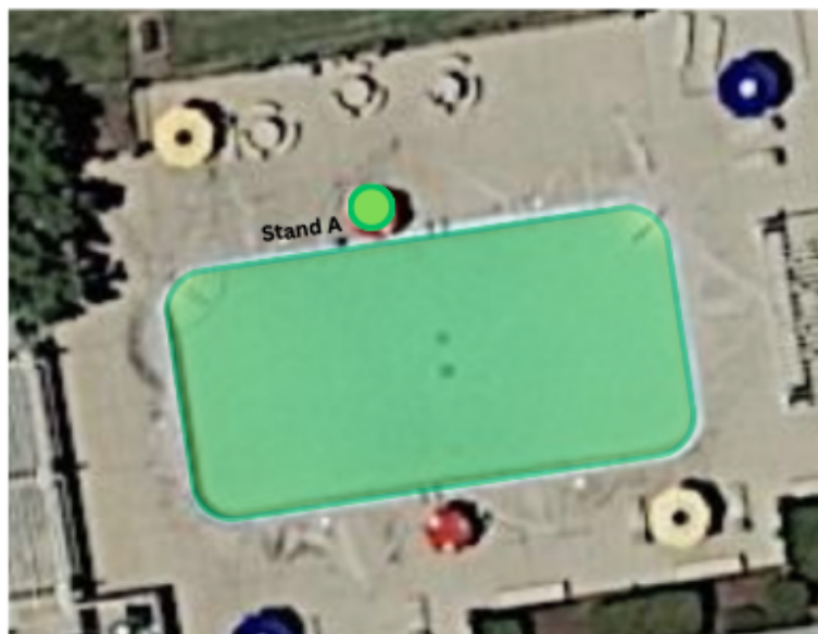
Minimum 1 Lifeguard - Total Coverage