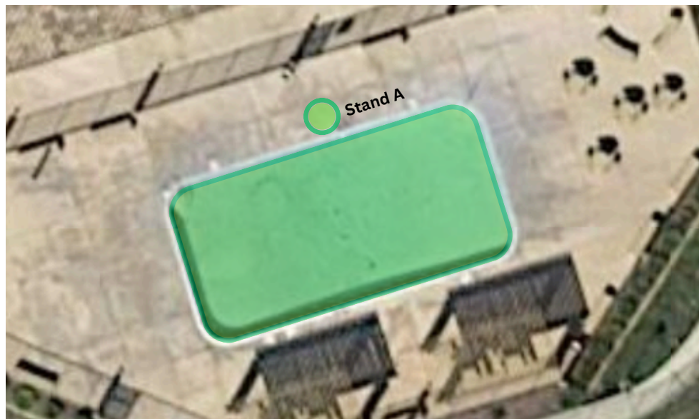
Minimum 1 Lifeguard - Total Coverage