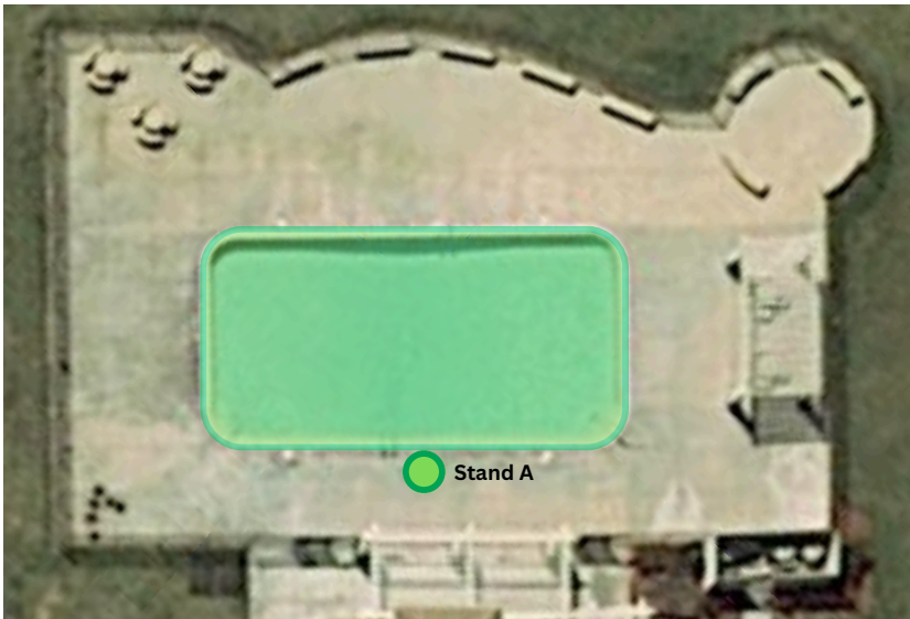
Minimum 1 Lifeguard - Total Coverage