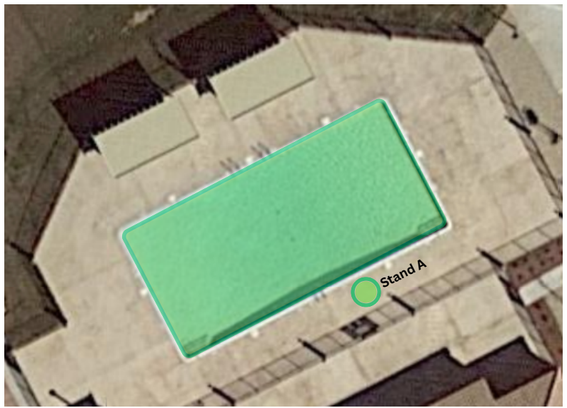
Minimum 1 Lifeguard - Full Coverage