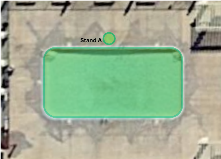
Minimum 1 Lifeguard - Total Coverage