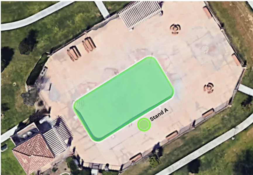
Minimum 1 Lifeguard - Total Coverage