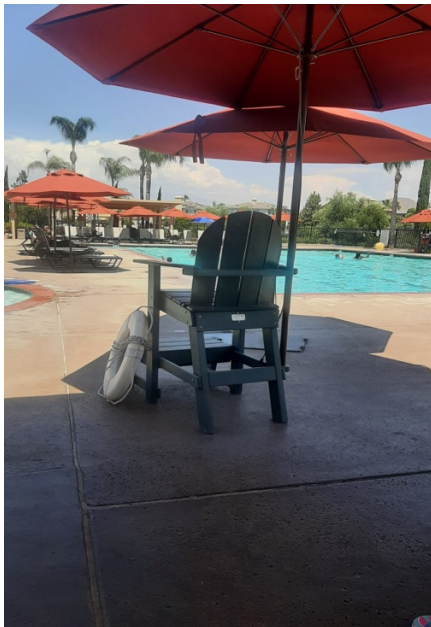
First Aid Station